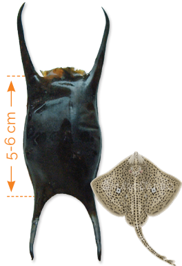
SPOTTED RAY Raja montagui

Capsule lengths are for soaked eggcases and exclude horns.