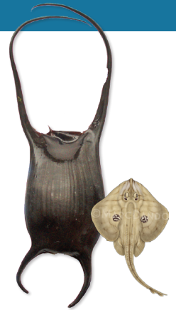
CUCKOO RAY Leucoraja naevus