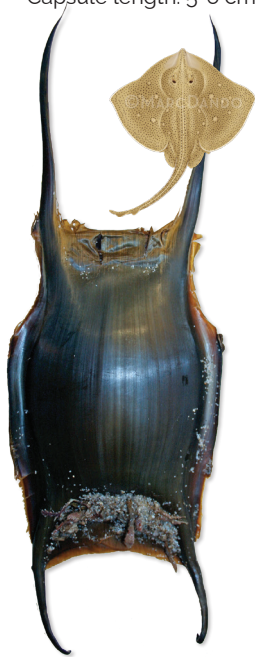
BLONDE RAY Raja brachyura