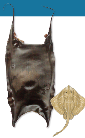
SMALL-EYED RAY Raja microocellata