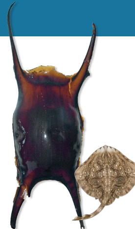
UNDULATE RAY Raja undulata