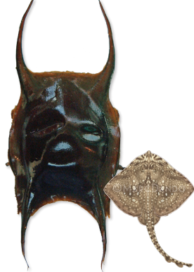
THORNBACK RAY Raja clavata