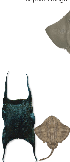
STARRY SKATE Amblyraja radiata