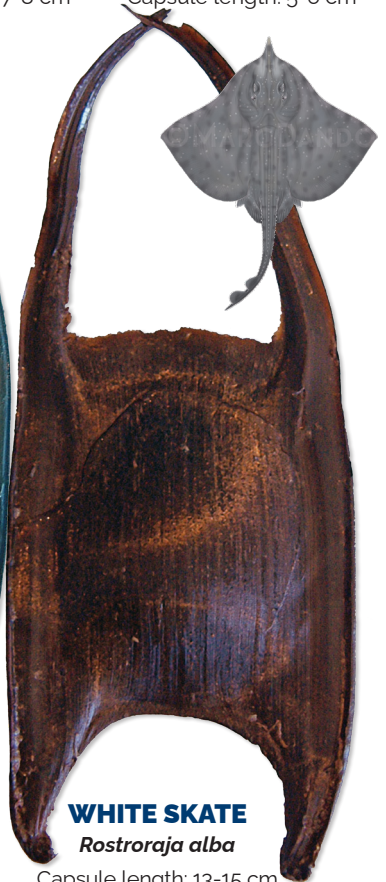
WHITE SKATE Rostroraja alba