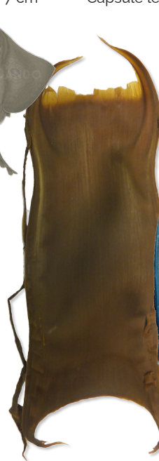
BLUE SKATE Dipturus batis