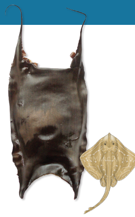
SMALL-EYED RAY Raja microocellata